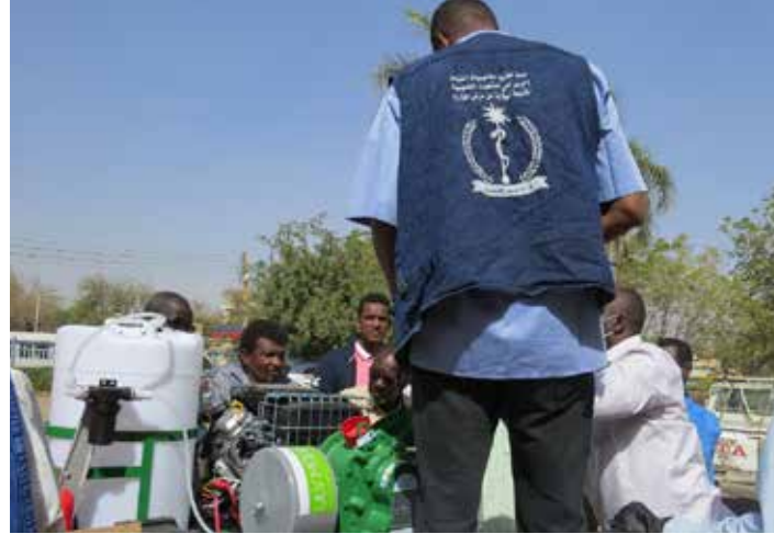
Training on Fogging Machines - Ministry of Health -Khartoum