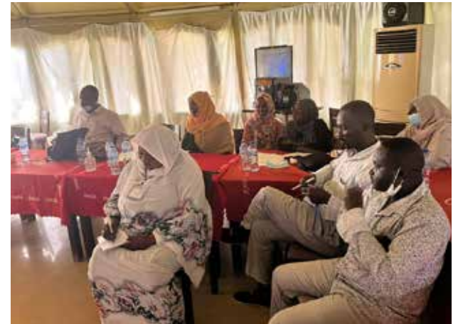
Training on Water Testing Kit - UNHCR - Kasala