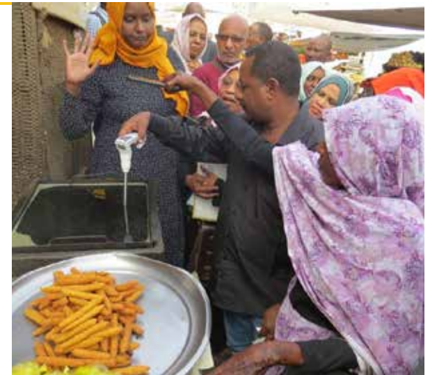
Training on Food Testing Kit - Ministry of Health - Khartoum