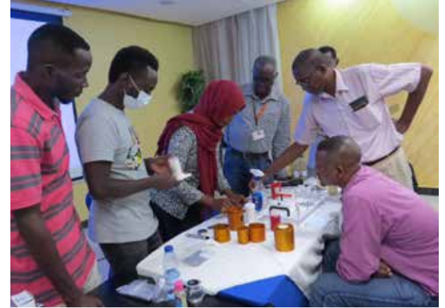
Training on Water Testing Kit - World Vision - Khartoum