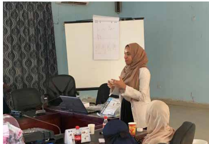
Training on Water Quality and Treatment Units - World Health Organisation (WHO) - Senja/ Sinnar State